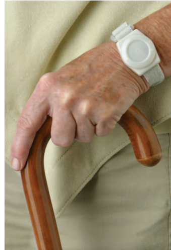
Just press a button and a wireless message goes out to the CareGard panel. Within seconds, an operator responds to your needs.