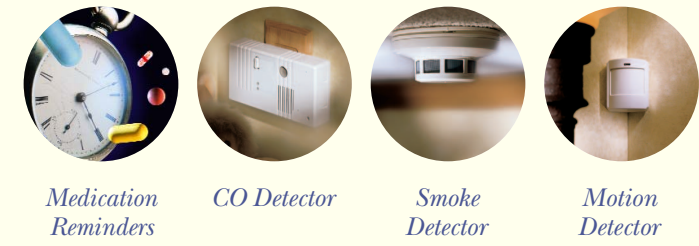
Medication Reminders CO Detector Smoke Detector Motion Detector

For even greater protection, you can add special features like medication reminders, smoke detectors and carbon monoxide sensors. There are activity sensors that send a call for help if you're not moving around as much as usual. You can even add freeze and flood sensors to protect your home when you're away.