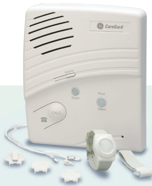
CareGard Contains: 1- CareGard Panel, 1- Personal Call Button and 1- User Manual

Rushing to answer the phone can be dangerous if you have health or mobility issues. CareGard lets you answer the phone from anywhere by simply pressing your Call Button. Talk immediately through the hands-free speakerphone, then take your time getting to the telephone.